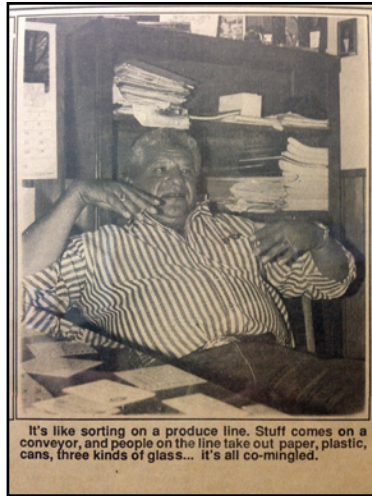
It's like sorting on a produce line. Stuff comes on a conveyor, and people on the line take out paper, plastic, cans, three kinds of glass... it's all co-mingled.